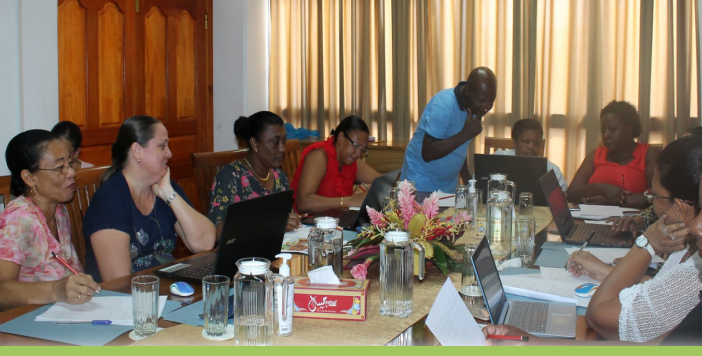
The training workshop conducted with the school leaders

In 2019, the project was launched in the Ministry of Education. Part of its implementation, included a pre-pilot phase which was conducted between September and October last year in five Pilot Schools. The schools were the Anse Aux Pins, Anse Boileau, Bel Eau, Beau Vallon and Takamaka Primary. It was organised to test the ECD indicators, developed specifically for this sector. This was an essential step in preparing for the main pilot phase to be underaken in all Primary Schools in 2021.