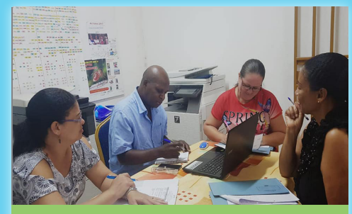
Visit at Anse Boileau Primary School