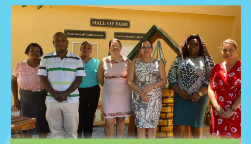
Visit at Beau Vallon Primary School