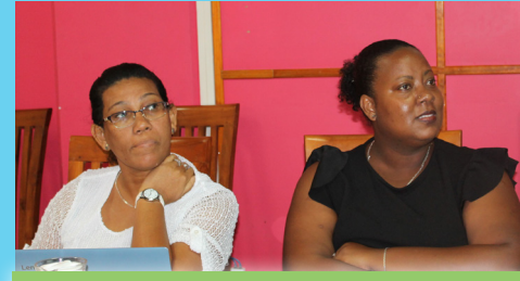
Workshop participants from Takamaka Primary