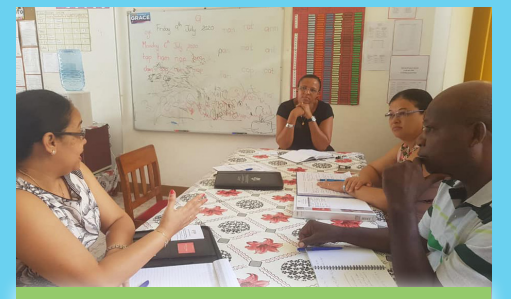
Visit at Bel Eau Primary School