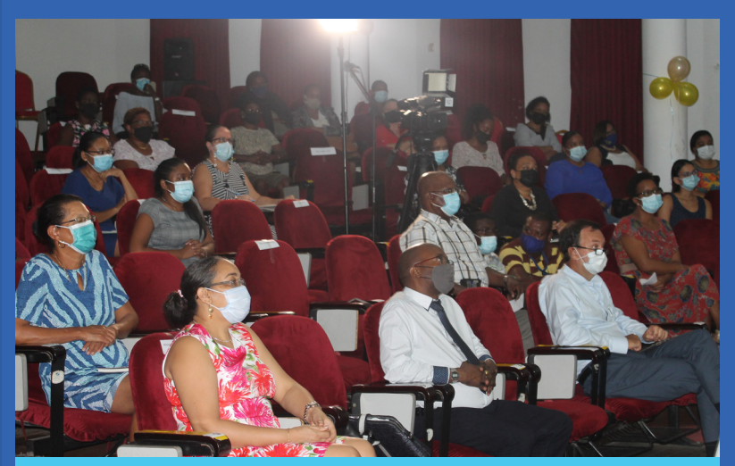
Participants during the first National ECCE Forum of 2021 as the findings of the 2020 Early Learning Readiness study were being presented