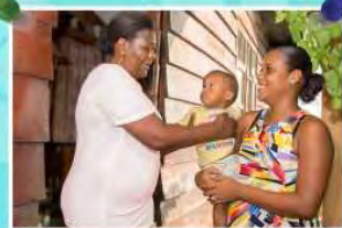
Family & Community Engagement

Produced by the Institute of Early Childhood Development in collaboration with ECCE Sectors and Partner Agencies