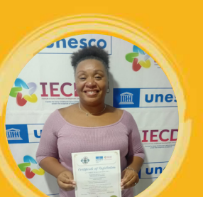
Lynn Azemia Little Lion Perseverance 2