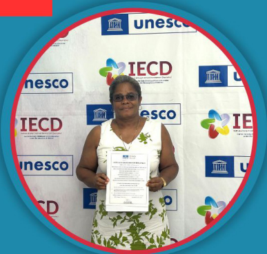
Stella Marie Rise & Shine Day Care Mont Fleuri