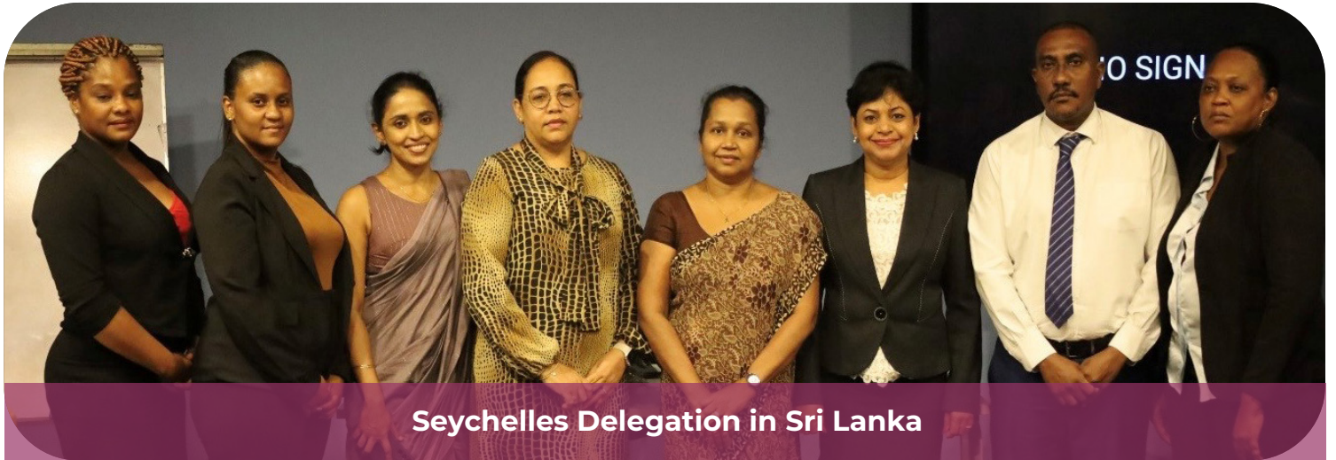
Seychelles Delegation in Sri Lanka

Explore some of the highlights and memorable moments from our international journey this year!