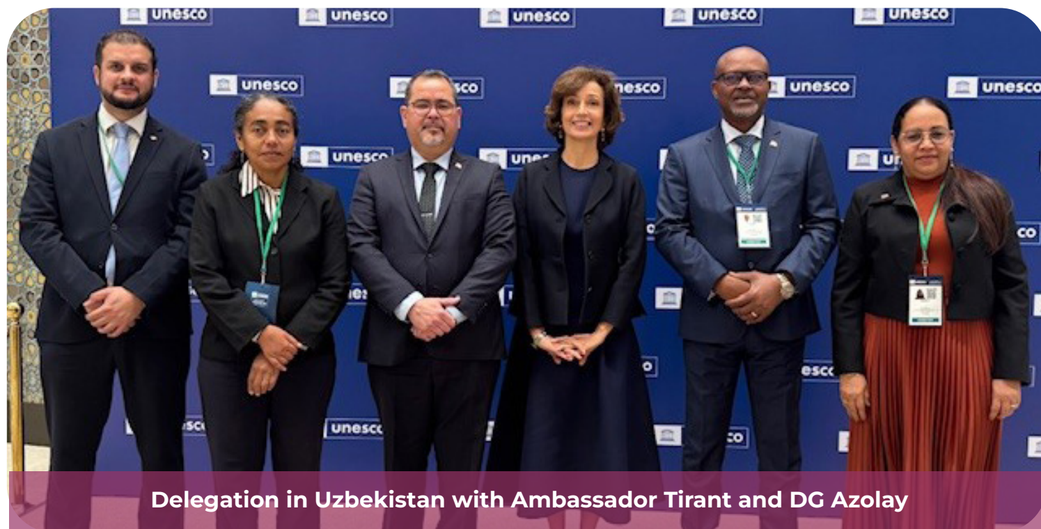
Delegation in Uzbekistan with Ambassador Tirant and DG Azolay

The IECD delegation attended the 43rd Session of the UNESCO General Conference in Samarkand, Uzbekistan, from 30th October to 5th November 2025. In a statement, the Seychelles delegation head highlighted Early Childhood Care and Education (ECCE) as a strategic priority for Seychelles, recognizing the crucial work and achievements of IECD as a UNESCO Category 2 Institute. Specifically, the hosting of Regional Workshops on the Tashkent Declaration and Commitments to Action for African and Arab Countries demonstrated Seychelles' commitment to regional solidarity and knowledge-sharing on best practices in ECCE. The statement also highlighted areas where IECD could provide potential support and assistance.